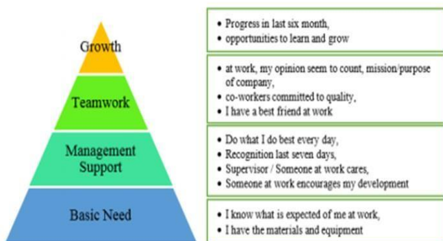
Figure 2: Gallup Modification Hierarchy.

Gallup developed a hierarchical model namely HRM Key Performance Indicators (KPI) adopted from Herzberg's, (Meiyani and etc., 2019) and used for measure employee engagement in many company include distribution company. In the Gallup hierarchy, there are four main dimensions and 12 main indicators to achieve engagement hierarchy in the organization. Such as basic needs management support, teamwork and, growth consists of; progress in the last six months, opportunities to learn and grow. Gallup modification hierarchy illustrated as in Figure 2.